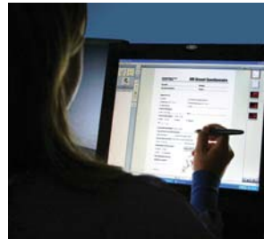
Rapid data entry with stylus tablet